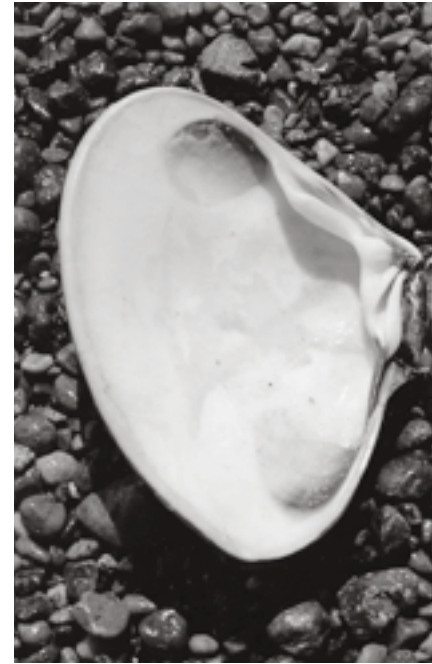
4. Untitled [Shells, Point Lobos], 1948. [4321]