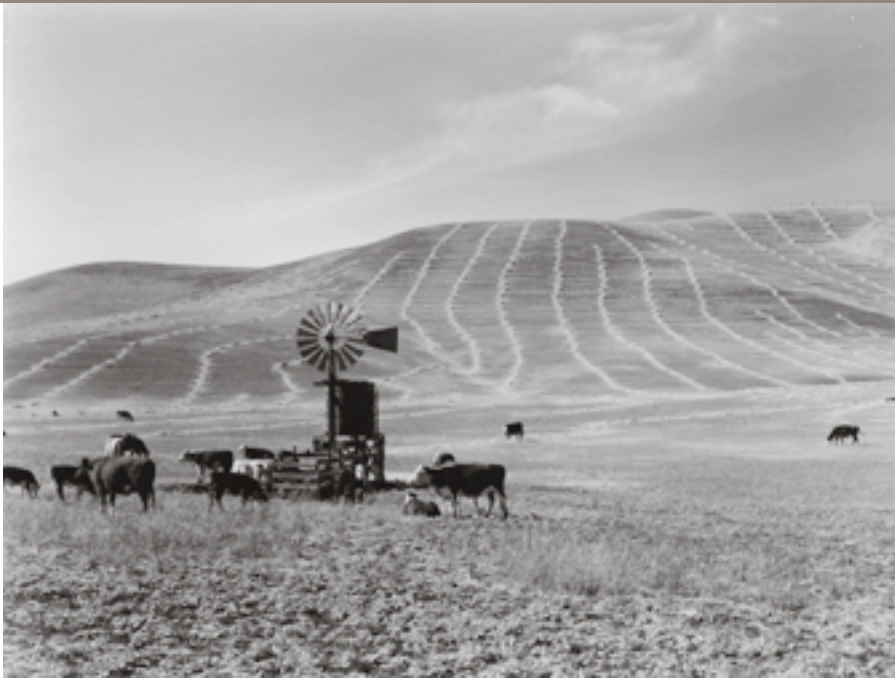
3. Untitled [Rural Landscape with Cows and Windmill], 1949. [4322]