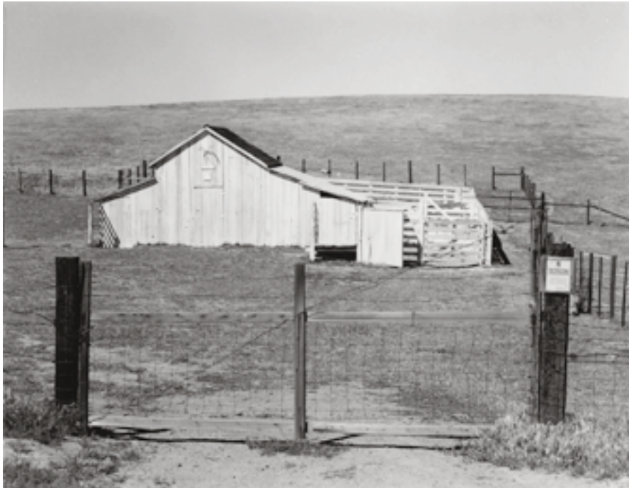
13. Untitled [Barn Northern California], 1949. [4304]