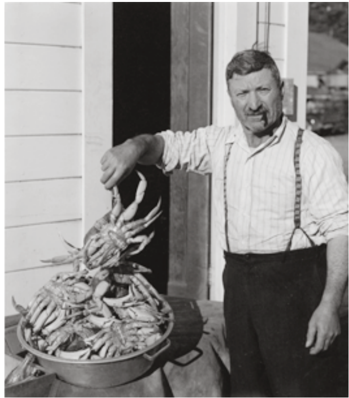
11. Noyo, 1948 [4315]