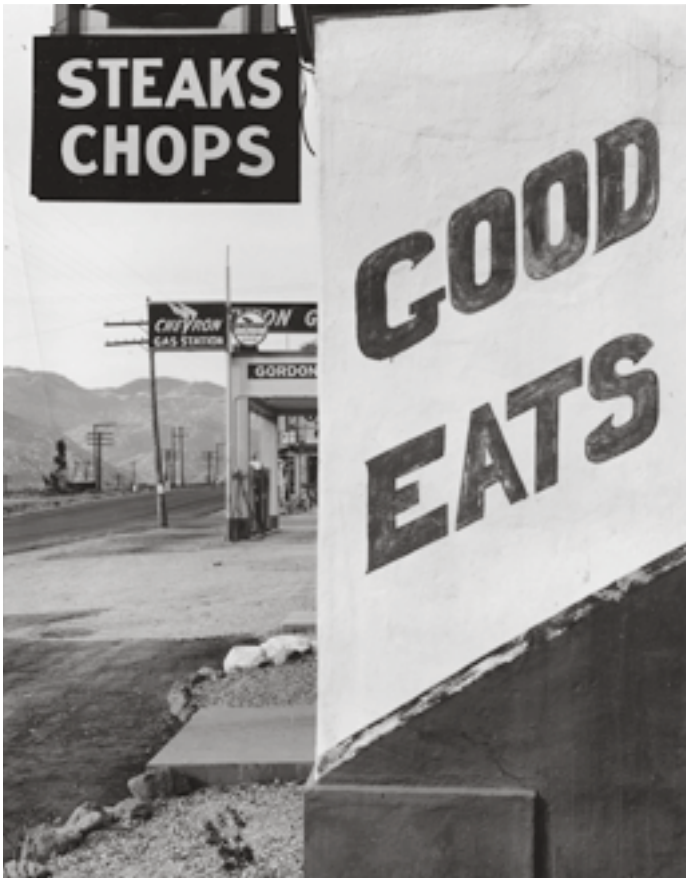
10. Untitled [Big Limit Cafe, Cabazon, California], 1948. [4307]