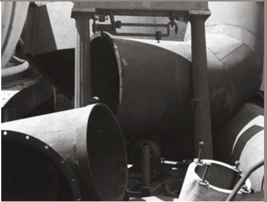
5. Untitled [Construction Pipes], 1949. [4324]