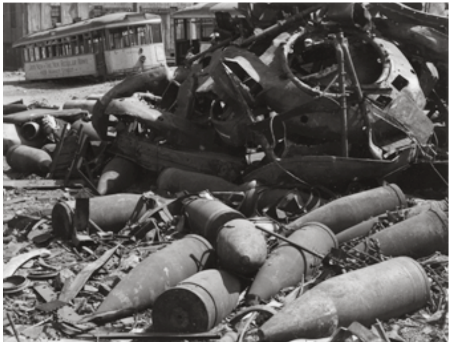
14. Untitled [Cable Car Junk Yard], 1948. [4325]

All photographs are signed and mounted vintage silver prints, approximately 4 1/2 by 3 1/2 inches in size or the reverse.