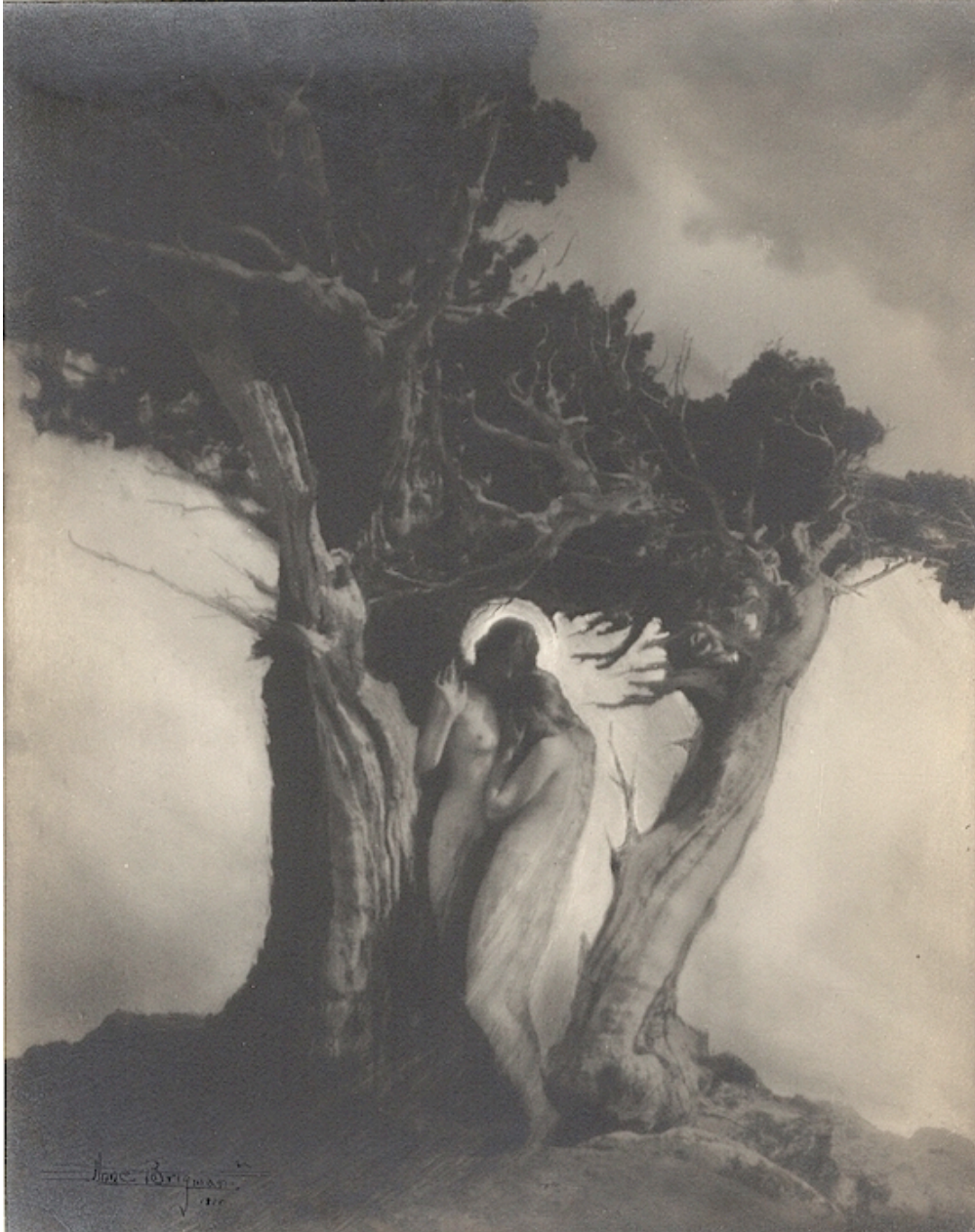
Anne Brigman [1869-1950]. The Heart of the Storm Vintage silver print, 1910 [8171]

Signed and dated in ink on the image; signed in pencil on the first mount; titled and annotated 'Toward Democracy' in pencil on the reverse of the third mount. 9 3/4 x 7 7/8"