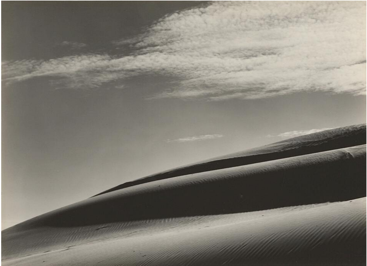
Edward Weston [1886-1958]. Dunes, Oceano Vintage silver print, ca. 1936. [7713]

Signed and dated on the mount; the negative number '61SO' in pencil on the reverse of the mount. 7 1/8 x 9 5/8"