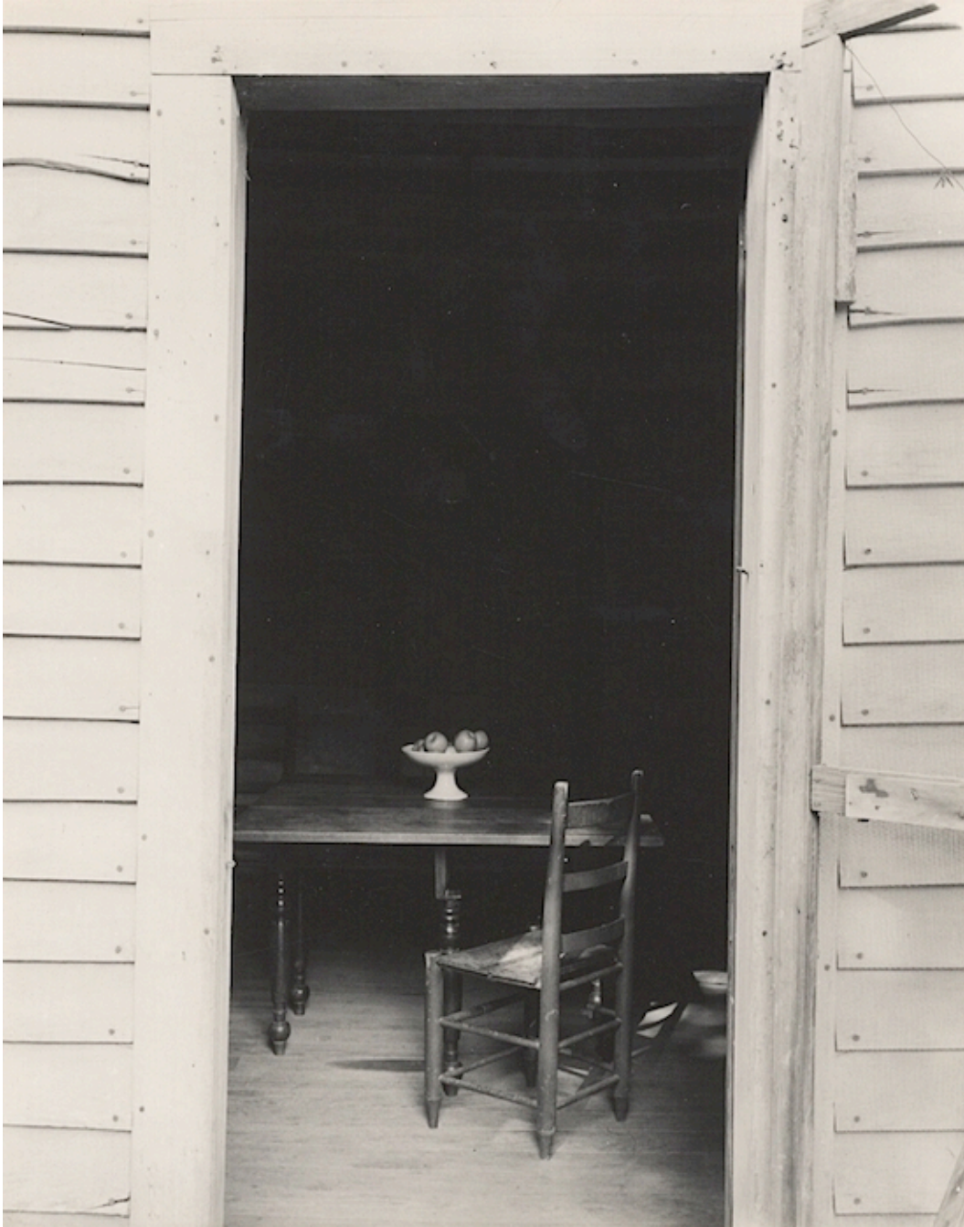
Wright Morris. Indiana Vintage silver print, 1951. [8187] Signed, titled and dated in pencil on the reverse of the print. 9 3/4 x 7 3/4"