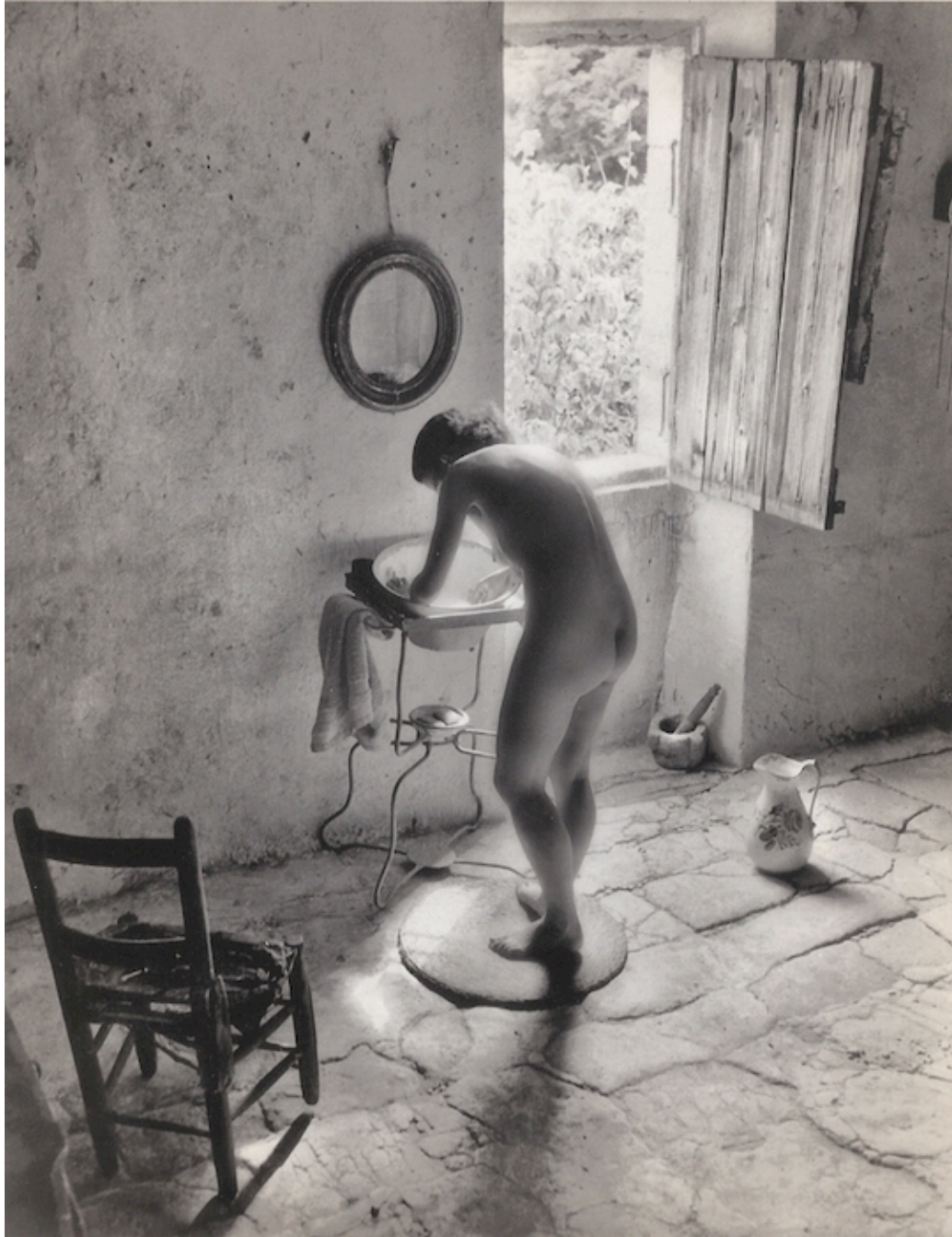
Willy Ronis [1910-2009]. Le Nu Provençal Vintage silver print, ca. 1949. [8198]

The photographer's stamp, title and date in pencil, and the © symbol on the reverse of the print. 9 x 7"