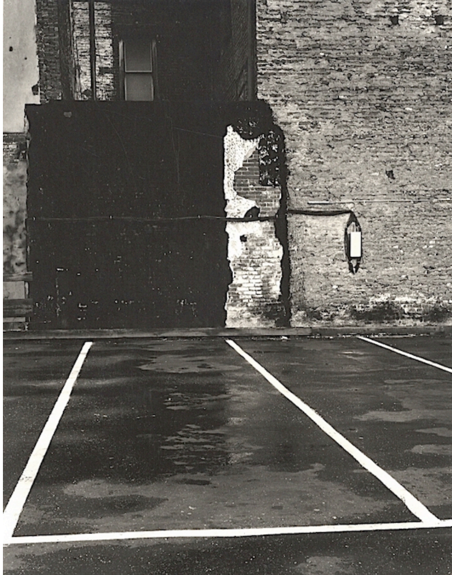
Minor White [1908-1976]. Parking Lot, Battery Street, San Francisco Vintage silver print, 1952 [7859] Signed and dated in pencil on the mount. 9 1/4 x 7 1/4"