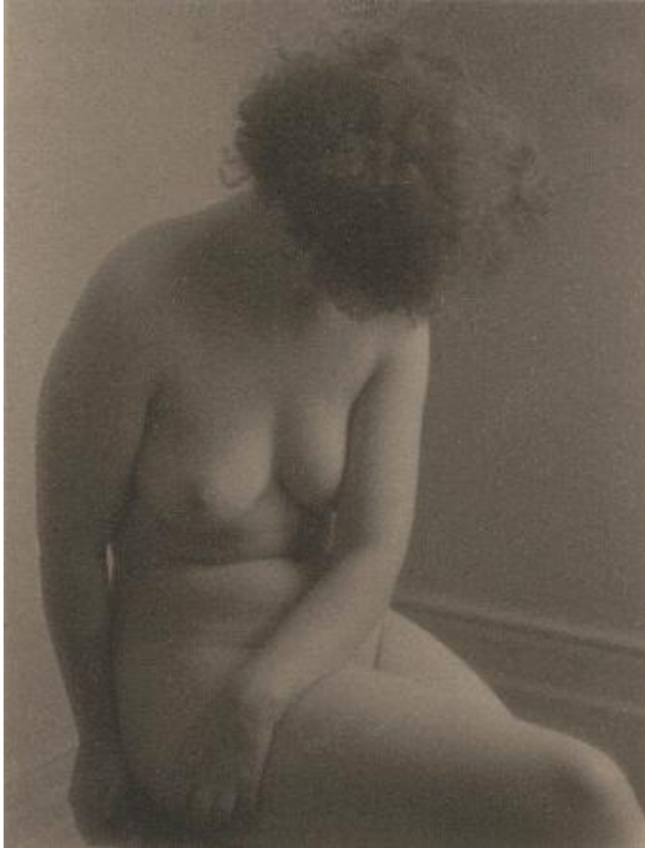
Paul Outerbridge [1896-1958]. Seated Nude Vintage platinum print, ca. 1922. [7755] The Paul Outerbridge Estate stamp on the reverse of the mount. 4 1/2 x 3 1/2"