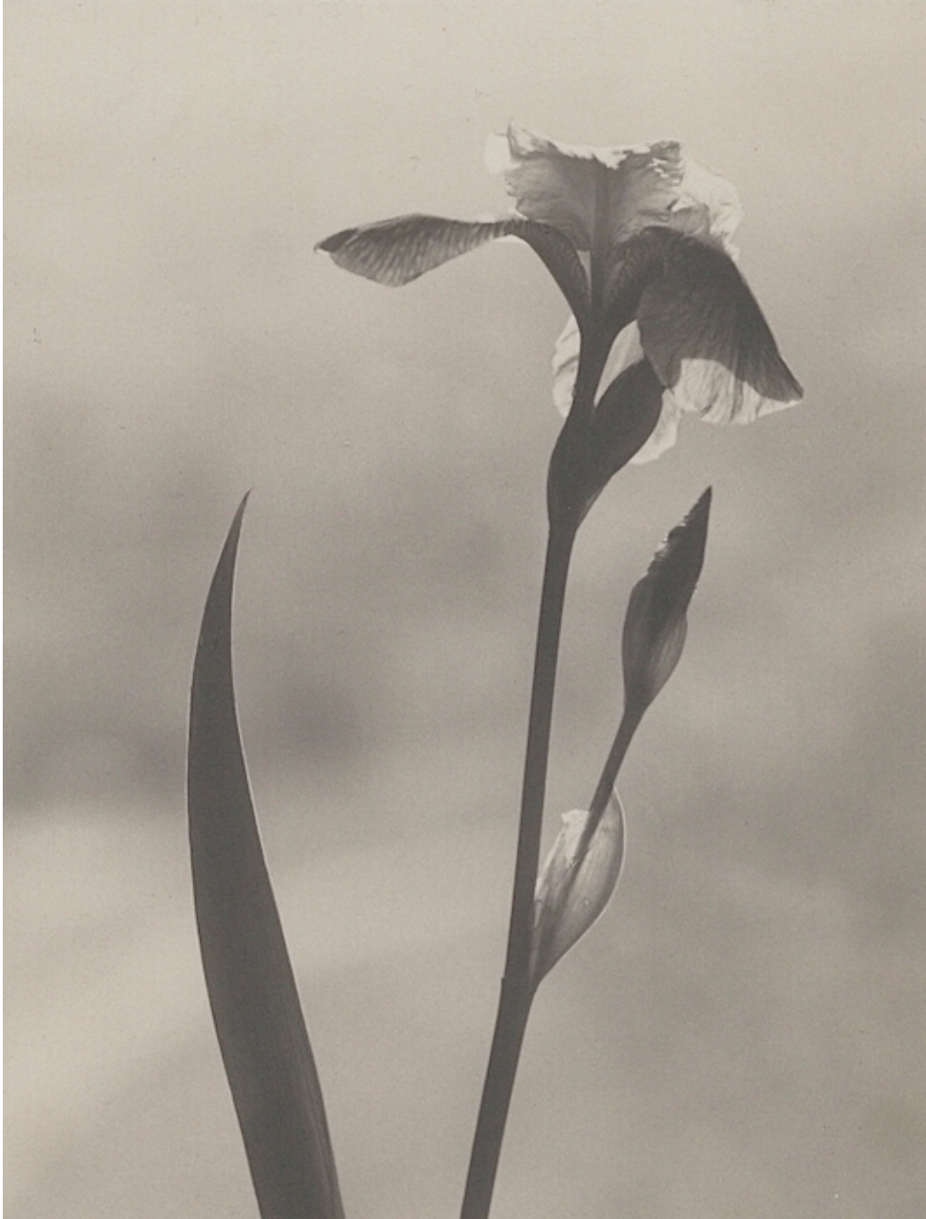
Laura Gilpin [1891-1979]. Iris Vintage silver print, 1924. [8195] Signed and dated in pencil on the mount. 8 5/8 x 6 5/8"