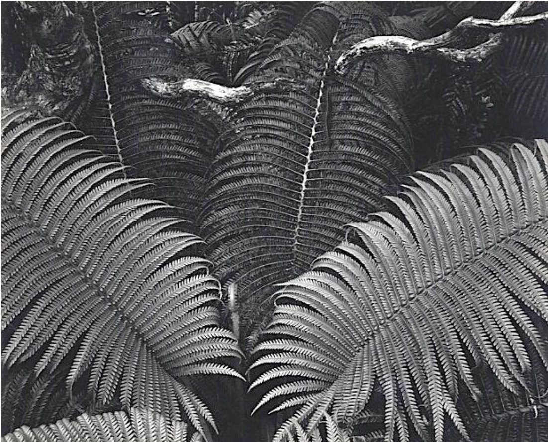
Ansel Adams [1902-1984]. Ferns, Rain Forest, Hawaii Vintage silver print, 1947. [6388] Signed in pencil on the mount; title and negative number '58' in ink and the photographer's stamp on the reverse of the mount. 5 1/8 x 6 1/4"

Illustrated: Adams & Joesting, The Islands of Hawaii [1958], p. 64.