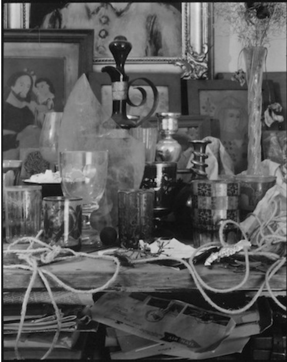
Josef Sudek [1896-1976]. Labyrinth Vintage silver print, 1967. [8228] Signed and dated with a stylus on the lower print margin. 11 1/4 x 9"

Provenance: Acquired from the Gert Sander Galley, NY, 2002.